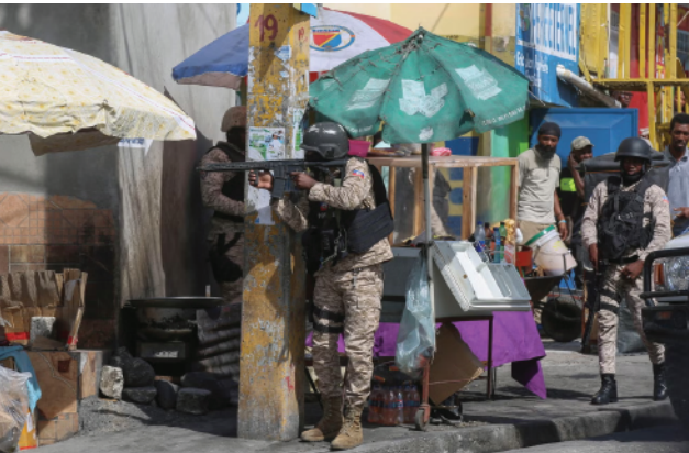
Haiti Violence